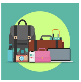
Use of Personal Items at School

CODE OF CONDUCT: A copy of our Code of Conduct - Practices & Procedures for Our Lady of Mercy School is available on our school website (under About Us) at <a href="https://www.alcdsb.on.ca/school/omer">www.alcdsb.on.ca/school/omer</a>. Please review behaviour expectations with your child(ren). Our classrooms and playground are places of peace and safety when everyone acts with kindness, respect and forethought. Thank you for your support!